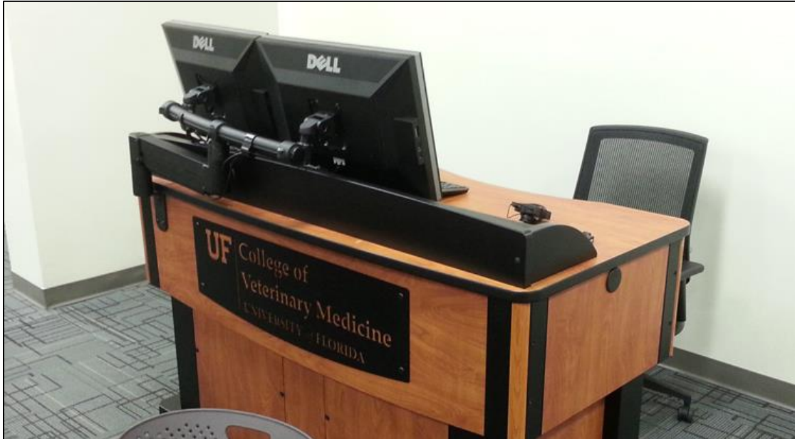
View of Instructor Station from Rear: